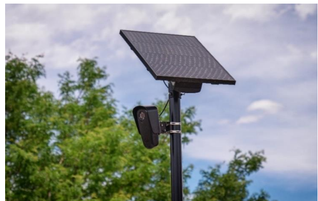
"Flock Safety ALPR Camera (53833285849)"

What can your agency do? While ALPR capture feeds are not required to be secured, agencies are highly encouraged to consider encrypting all data feeds to protect the information and those of the communities which they serve. By encrypting the traffic of the camera feed into your secure network, you can reduce or eliminate potential points of vulnerability and keep the data from being compromised. Securing the feeds and information of ALPR systems helps agencies to earn trust within the communities while also protecting crucial data for solving crimes.